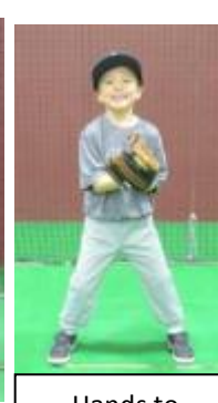
Hands to Bellybutton