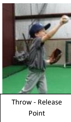
Throw - Release Point