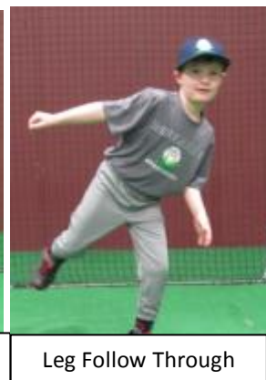
Leg Follow Through