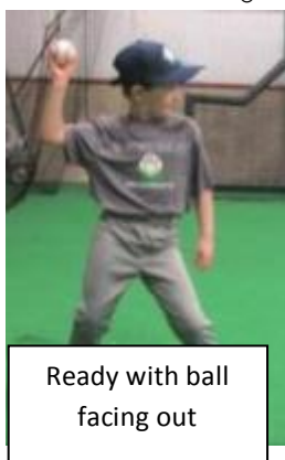
Ready with ball facing out