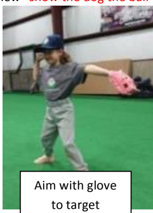
Aim with glove to target